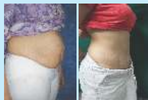
▲ Liposuction / Lipectomy