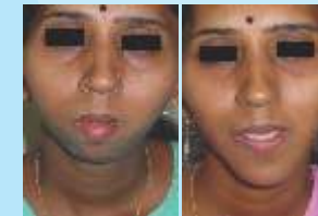
▲ Chin Implant