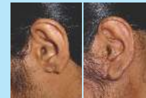
▲ Ear Lobe Reconstruction